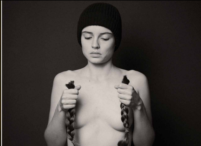
Merit Award