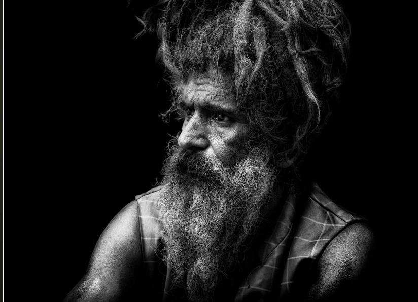
© Somdutt Prasad - Merit Award