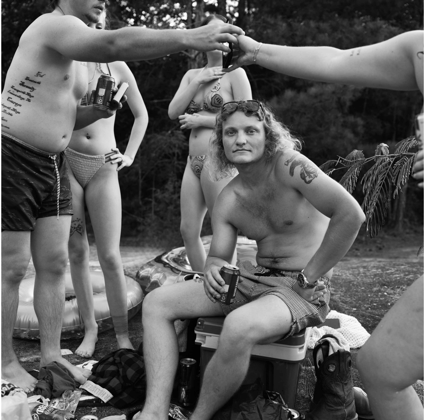
Featured Image: ' Quarry Soldier ' from the series ' Of The South '

The Second Place Winner is Ian McFarlane (United States) with the series ' Of The South '.