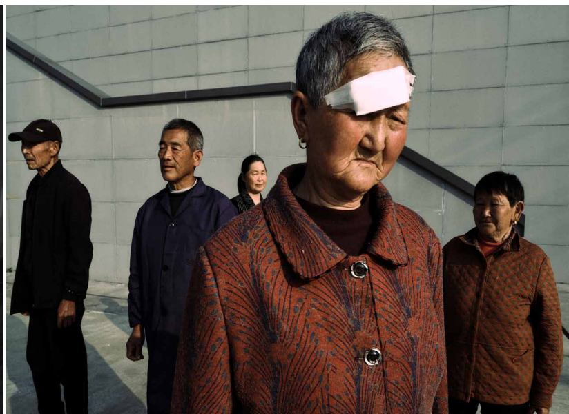
Media Contact: awards@all-about-photo.com