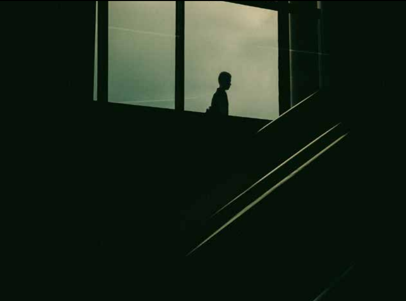
© Tommy Viitala - Merit Award