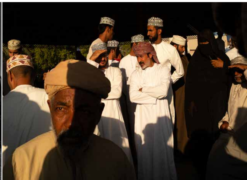
© Marika Poquet - Merit Award