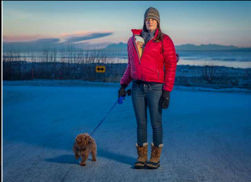
Merit Award