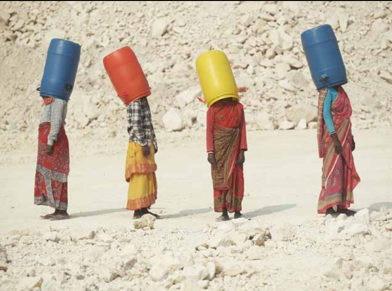
© Somenath Nukhopadhyay - Merit Award