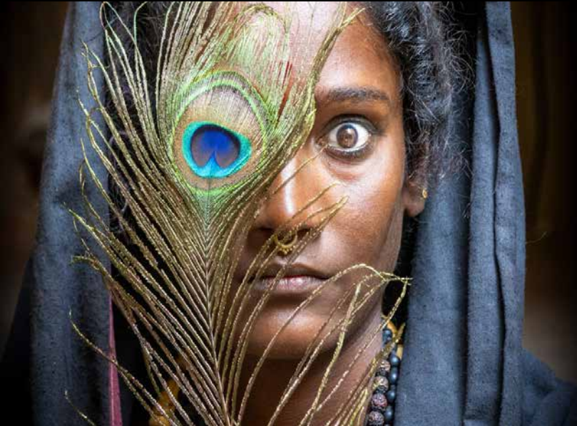
Merit Award