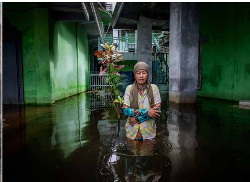
Merit Award