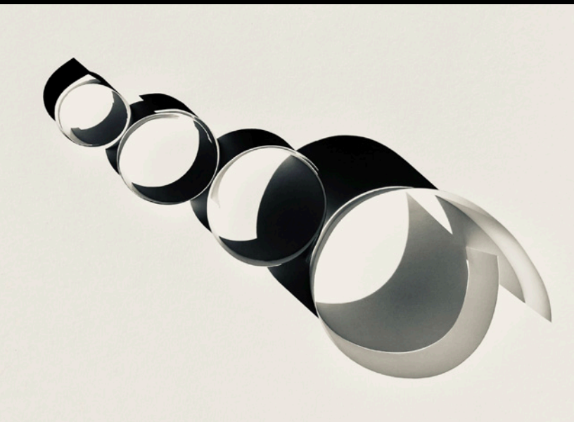
Merit Award