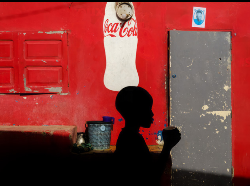
© Costas Delhas - Merit Award