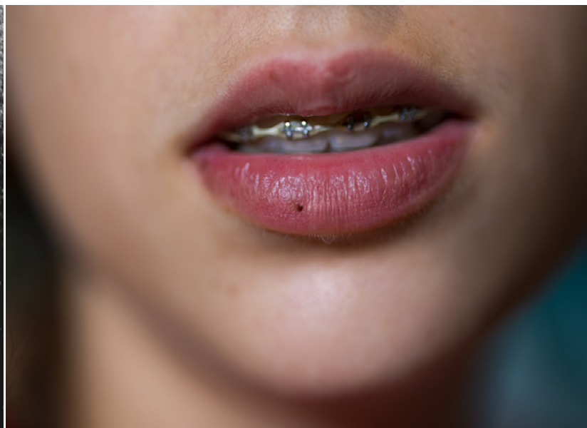
Merit Award