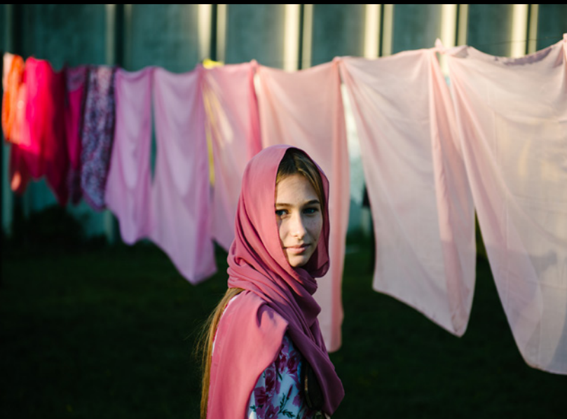
© Bahrudin Bandic - Merit Award