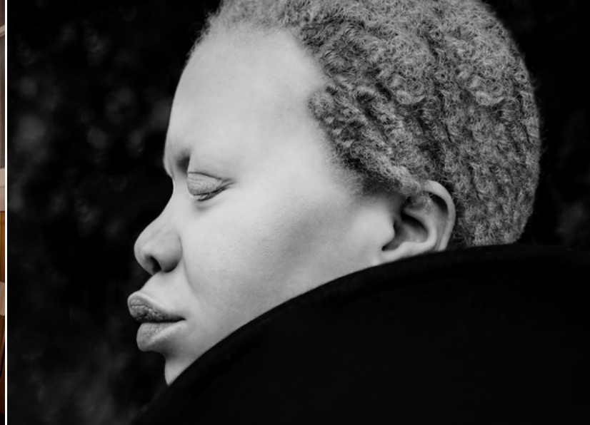
Merit Award