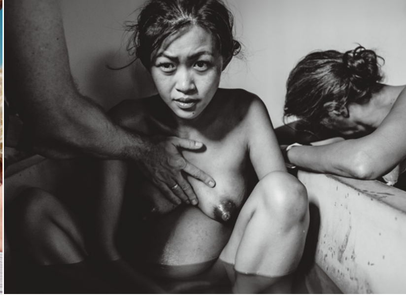
Merit Award