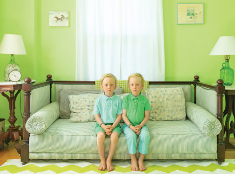
© Emily Fisher - Merit Award