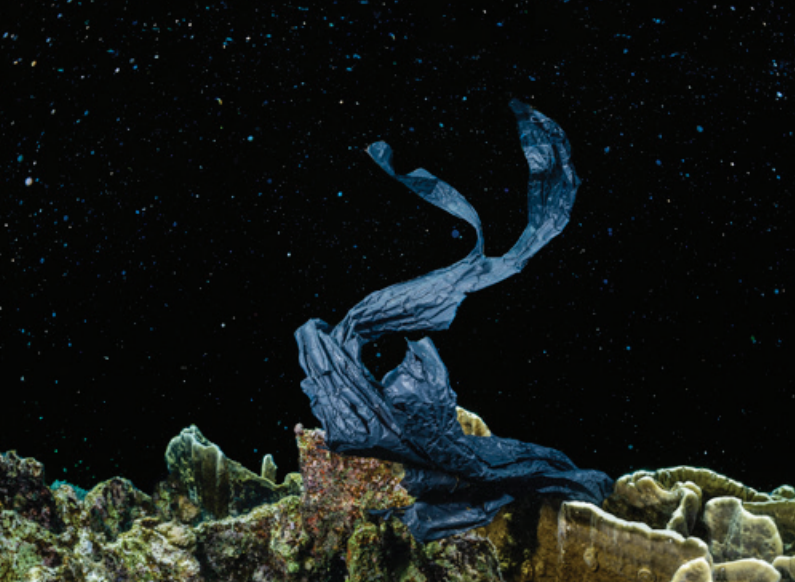
© Ahmet Turgay Uzer - Merit Award