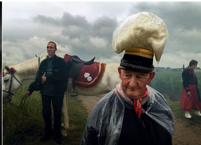
Media Contact: awards@all-about-photo.com