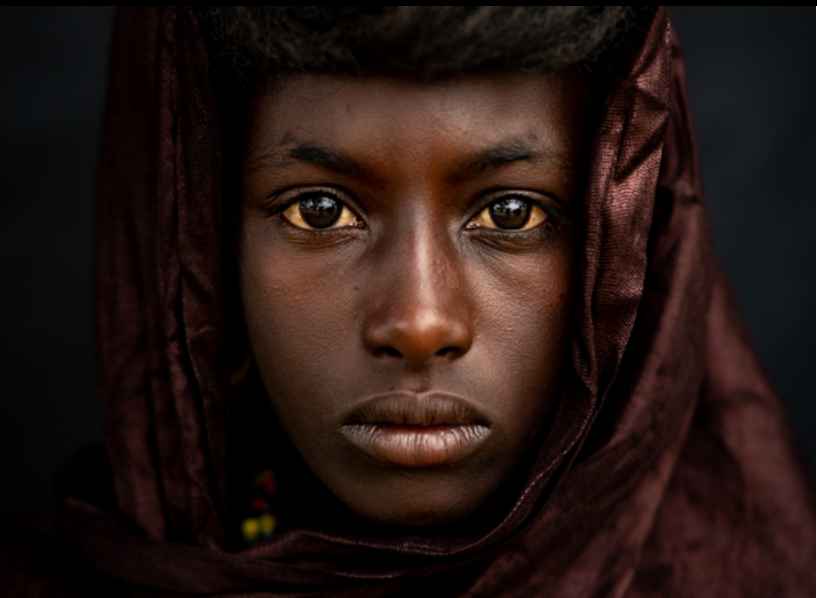
Merit Award