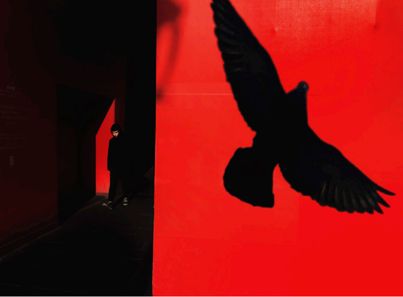
Merit Award