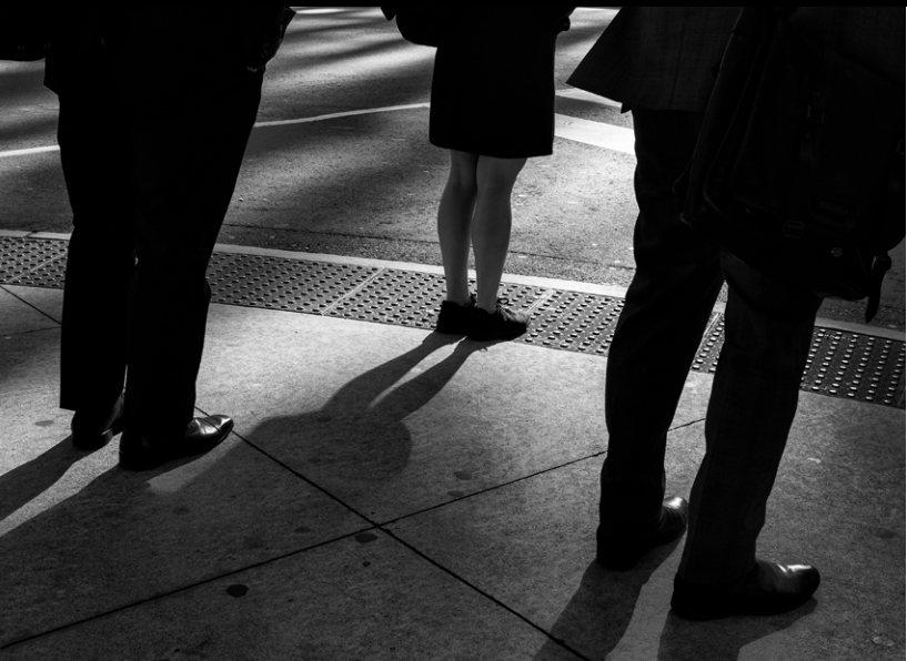
© Randall Romano - Merit Award