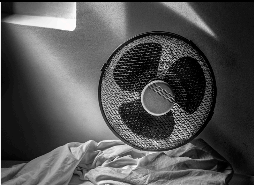
© Holger Goehler - Merit Award