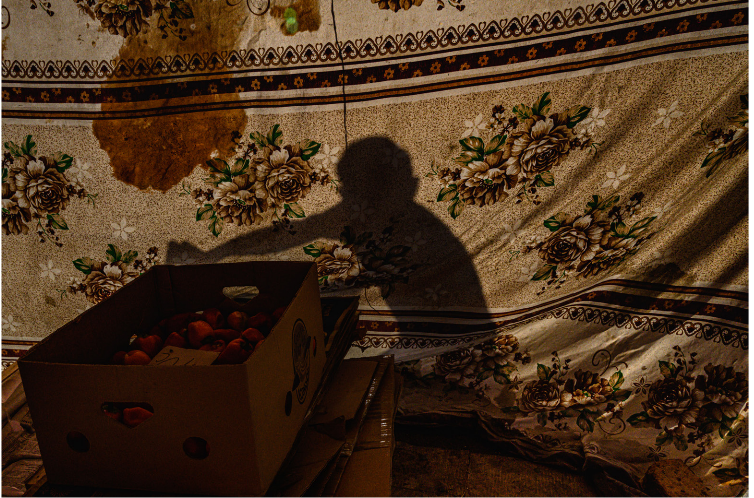
Featured Image: The Veil of Dream © Anna Biret

The Winner of AAP Magazine 30 Shadows is Anna Biret (Poland/France) with the series " The Shadows of the Imagination "