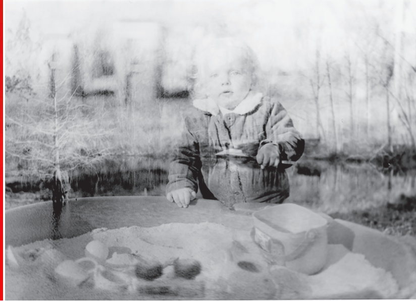
Merit Award