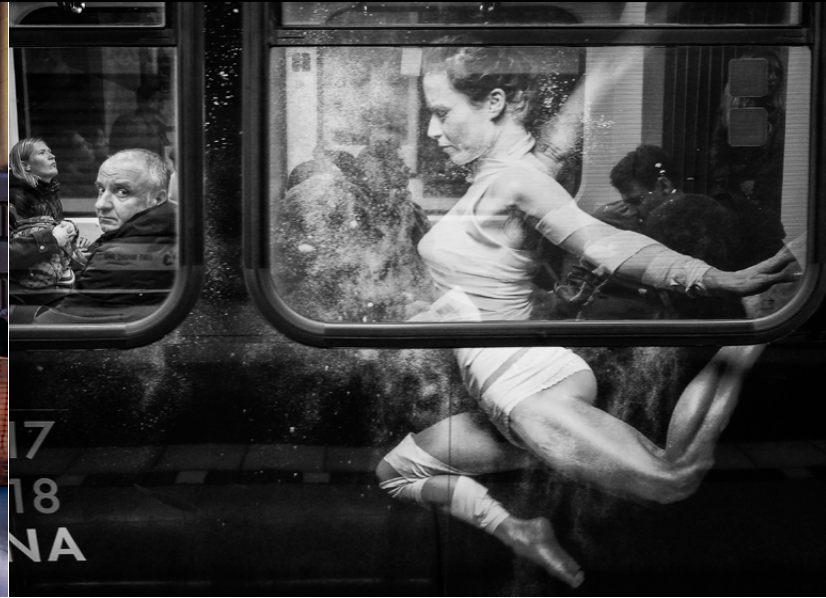
Merit Award