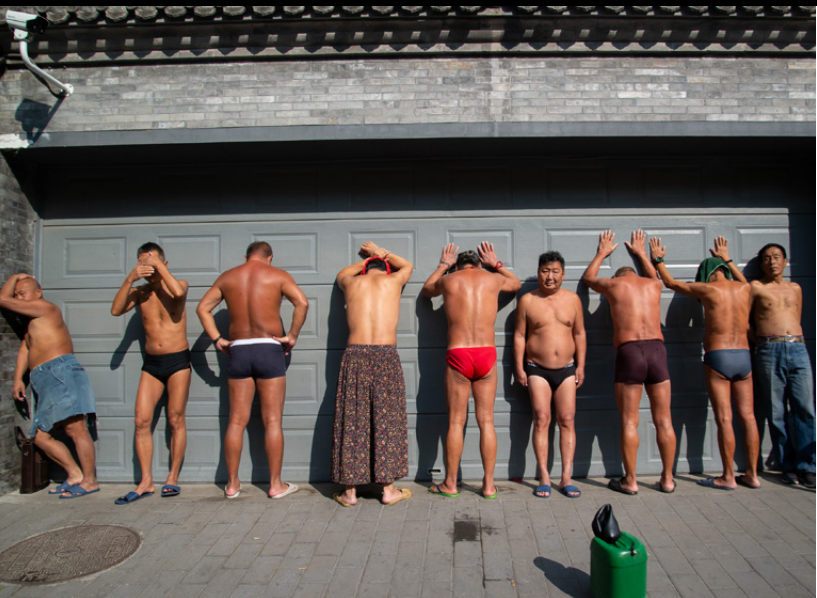
© Pelin Guven - Merit Award