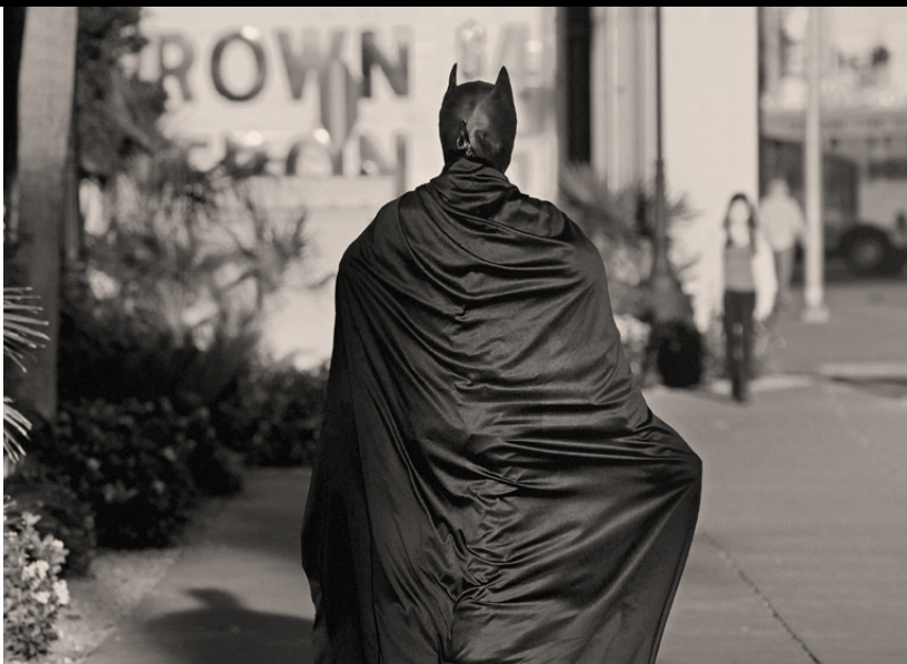
© Henk Kosche - Merit Award