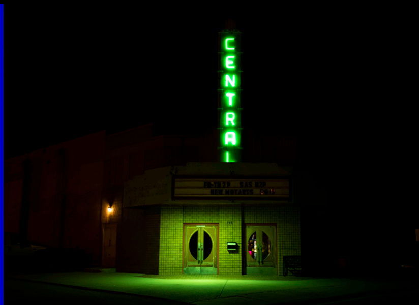
© Virginia Hines - Merit Award