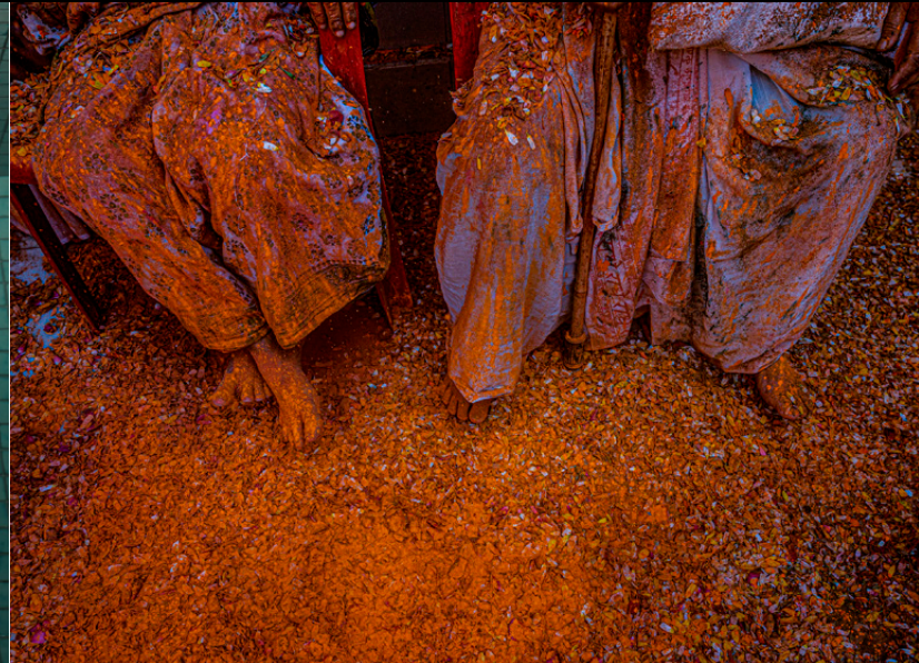
© Hardijanto Budiman - Merit Award