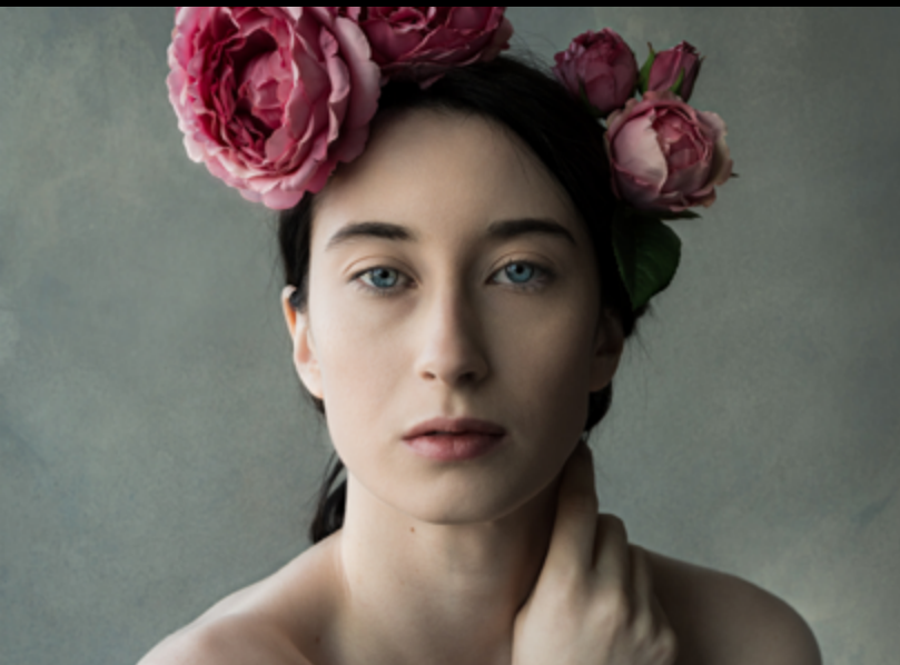
© Pat Rose - Merit Award