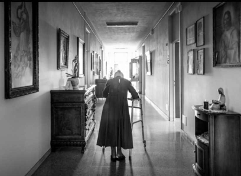
© Monica Testa - Merit Award