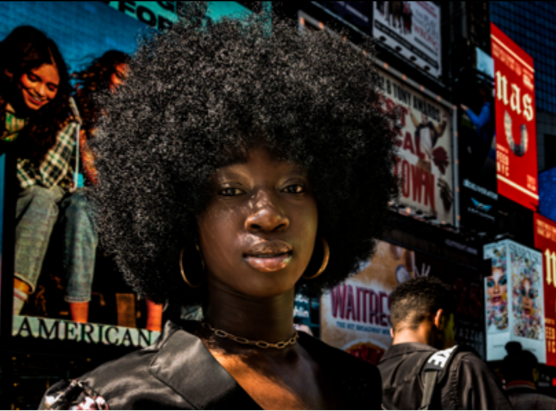
© B Jane Levine - Merit Award