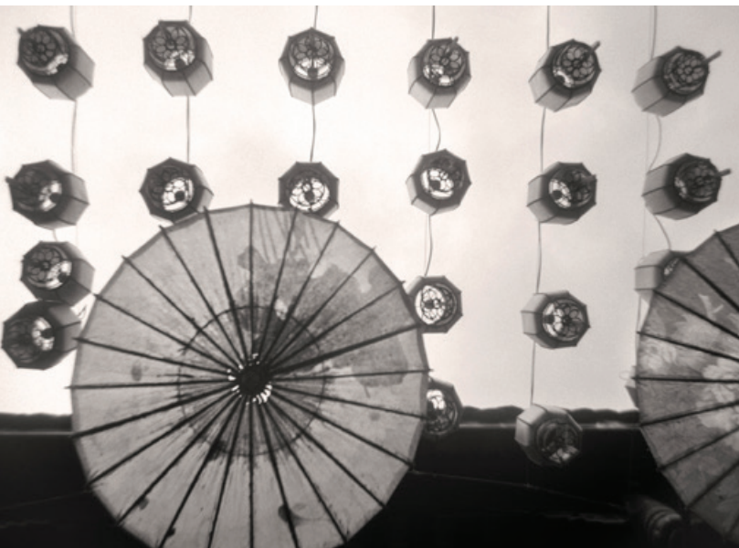
© Ragnar B. Varga - Merit Award