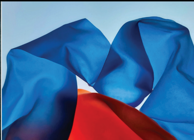
© Marlou Pulles - Merit Award