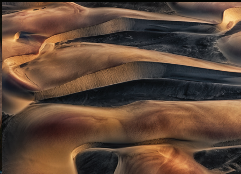
Merit Award