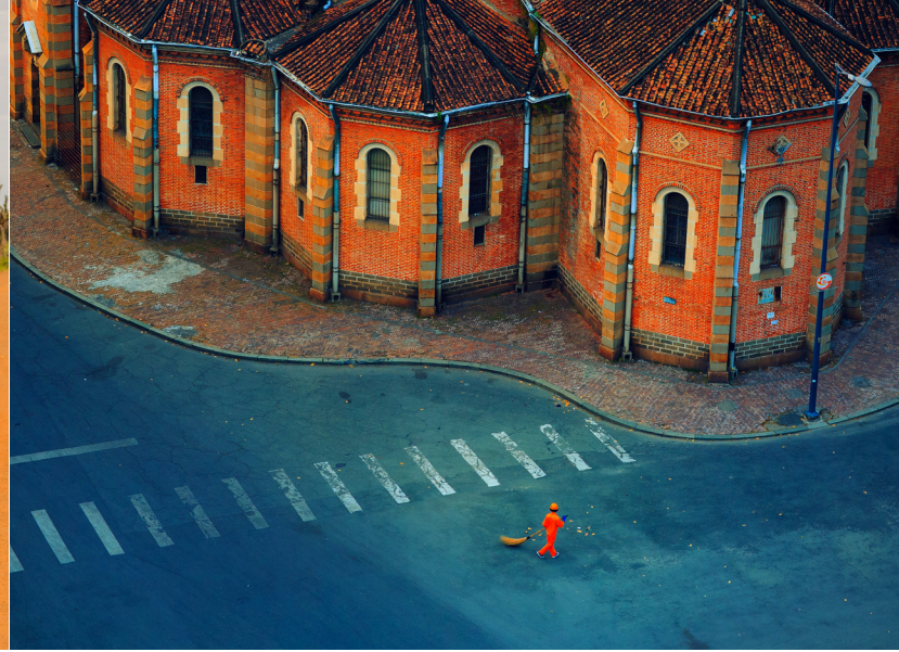
Merit Award