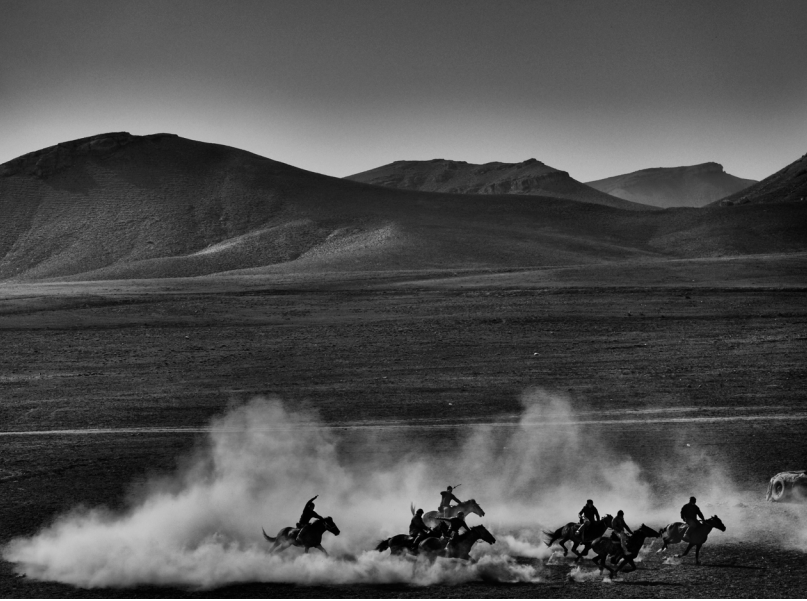
© Alain Schroeder - Merit Award