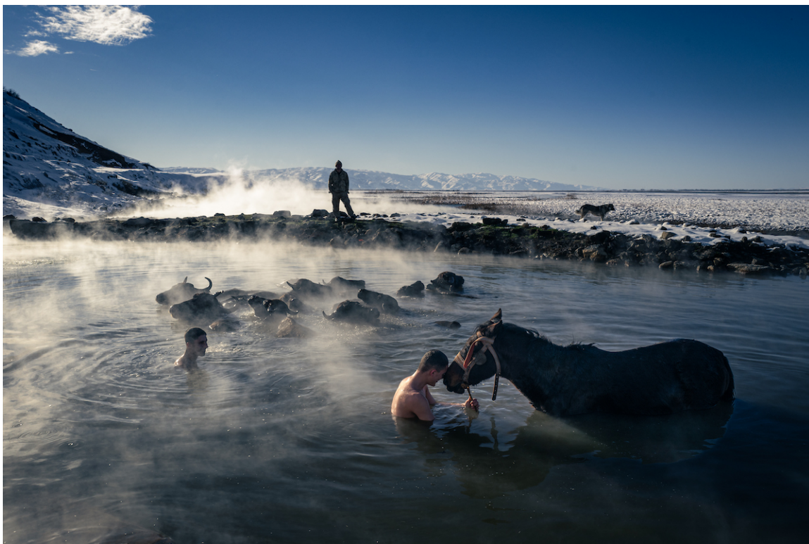
3 rd Place Winner: Hot Springs of Budaklı