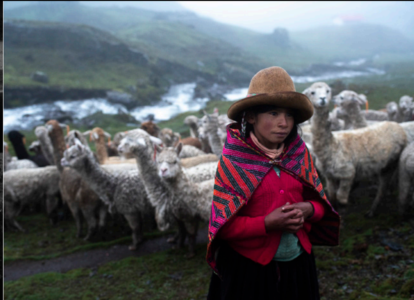
© Ilaria Miani - Merit Award 2024