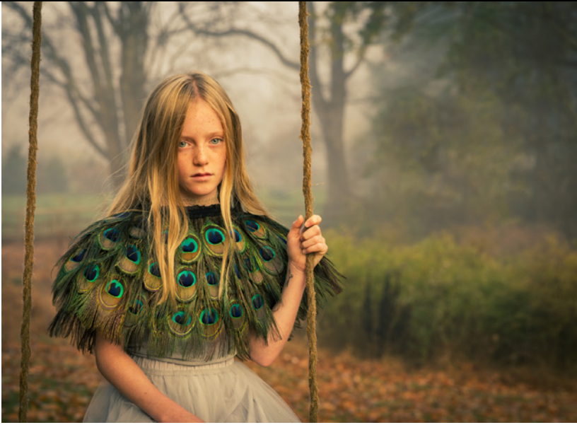
© Emily Fisher - Merit Award 2024