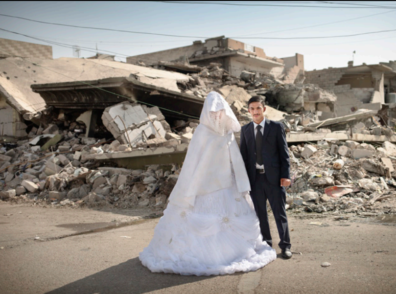
© Véronique De Viguerie - 2 nd Place Winner 2024