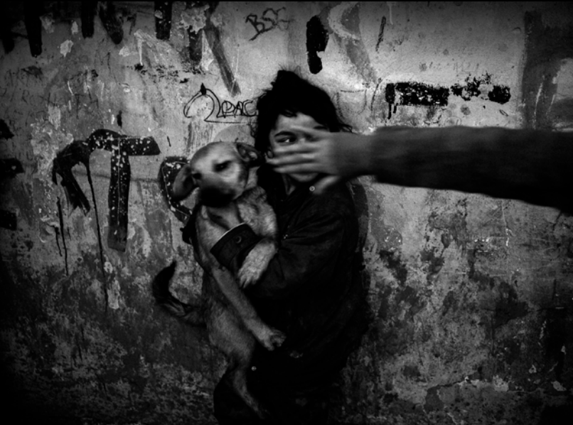
© Damian Lemański - Merit Award 2024