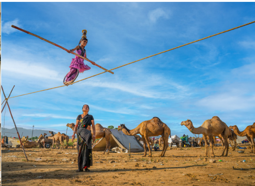
Media Contact: awards@all-about-photo.com