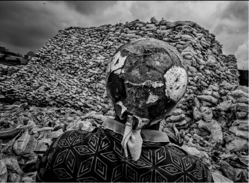
© Alain Schroeder - Merit Award 2024