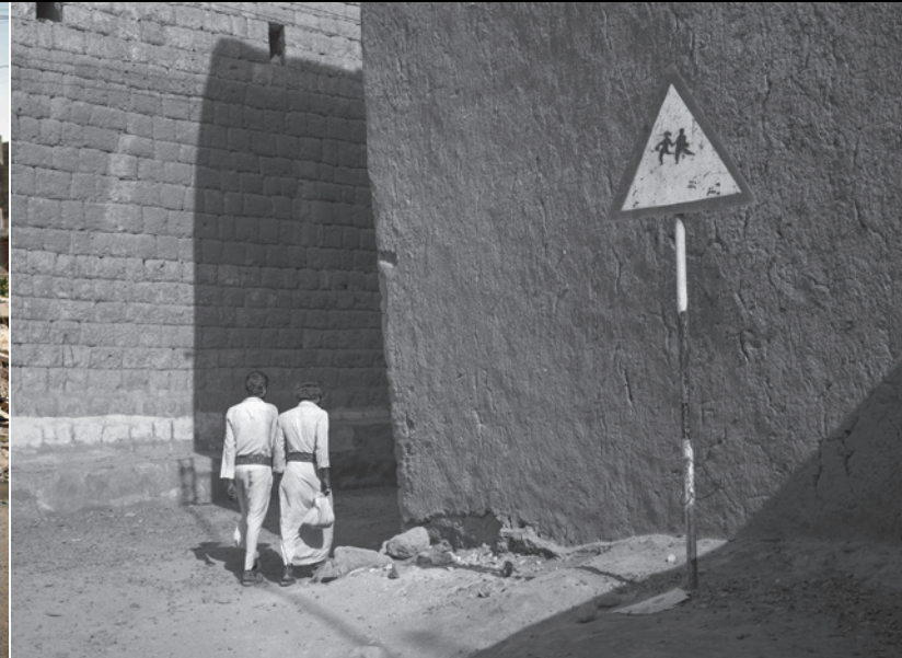
© Lieven Neirinck - 3 rd Place Winner 2024

Véronique De Viguerie captures a young couple on their wedding day, presenting what might have been a traditional wedding portrait, were it not for the stark backdrop of the devastated cityscape of Mosul, Iraq. A poignant depiction of love and war encapsulated within a single frame.