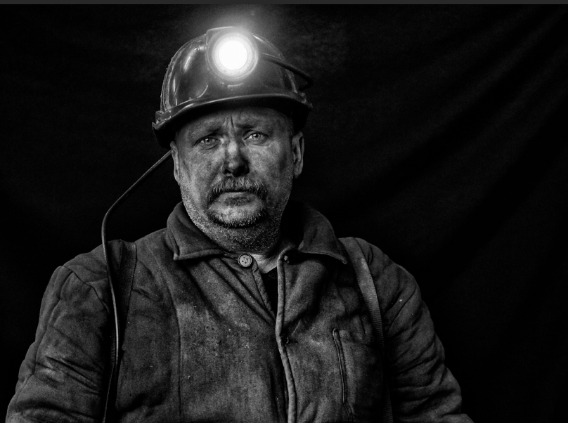
© Istvan Kerekes - Merit Award