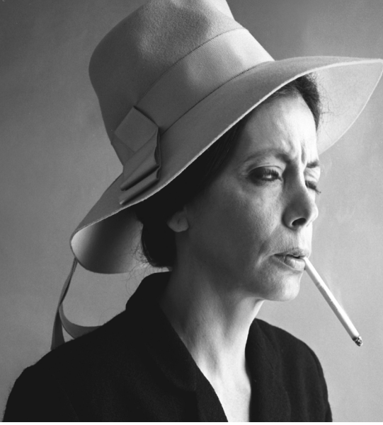
© Terry Wild - Merit Award